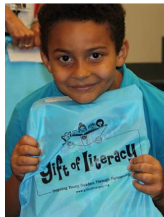
A 1st-grader waits to open his special bag with his book inside.

Since 2005, 10,572 books have been distributed to 1st-graders and libraries and 25,302 items have been checked out with special public library cards.