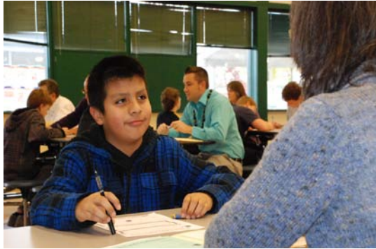
A 6th-grade Hamlin student listens to his adult mentor as they discuss his grades and future.

After hearing from our principals that providing mentors was the #1 way for volunteers to help, SEF increased its efforts this year to recruit friends, colleagues, donors and associates to mentor students.